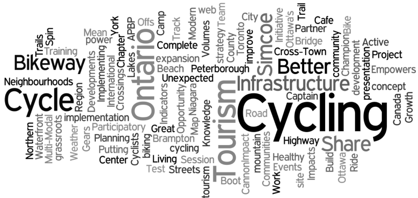
Word Cloud: Summary of all presentation titles from concurrent sessions

A breakdown of all participants shows that all 4 regions of Ontario were in attendance.